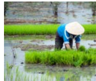
CH 4 Isotopes