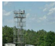
CH 4 , N 2 O, CO, CO 2 , H 2 O