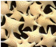
Clumped CO 2 Isotopes*

HIGHER PRECISION AND ACCURACY IS OBTAINABLE WITH MID-INFRARED LASERS