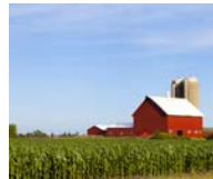
N 2 O Isotopes