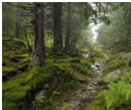
CO 2 , Water Isotopes