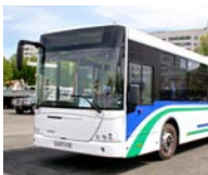
NO, NO 2